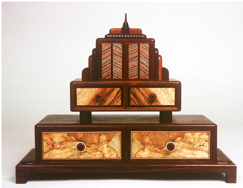
Land Taken Over by High Rising Structures, 1978