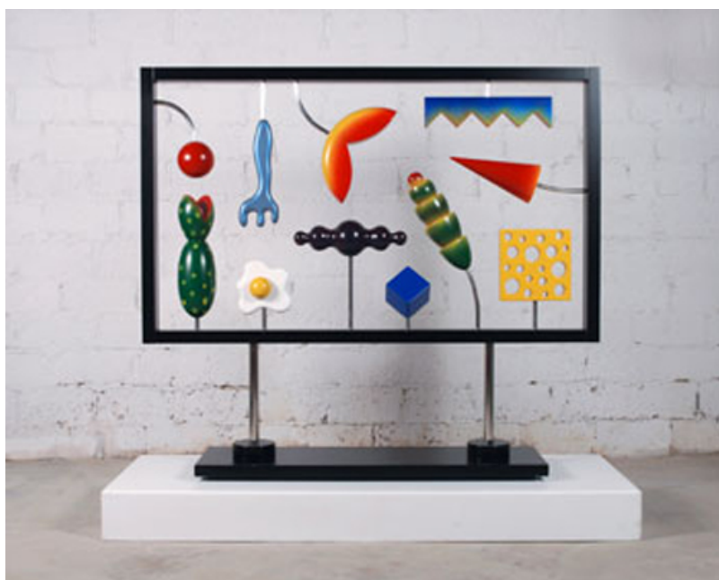
Eat or Be Eaten , 2009

Steve Madsen: A World in Wood October 9 - December 19, 2009